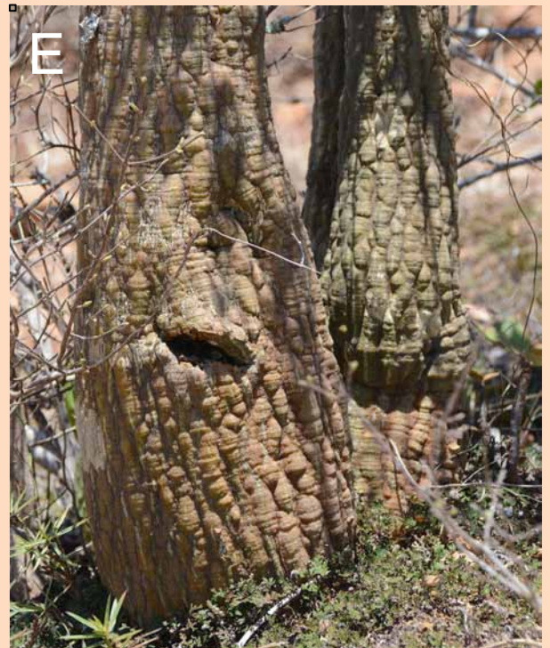
C. Habitat shot where Adenia alaboensis is found near Isalo, Madagascar, D. Adenia alaboensis with leaves E. Closer view of the trunk.

Some species play an important role in traditional African Medicine. Other species of Adenia are poisonous and the fruit of Adenia digitata has been used by people to commit suicide. This species of Adenia is also cultivated as an ornamental.