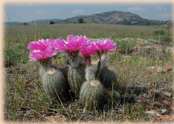
Echinocereus reichenbachii subsp. baileyi in the Wichita Mountains NWR, Oklahoma. Mount Scott in the background.

WEBPAGE https://sites.google.com/site/cocssok/