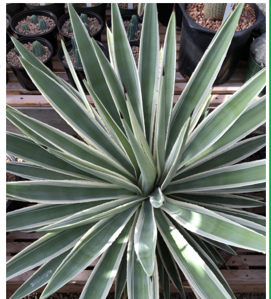
Agave angustifolia variegated