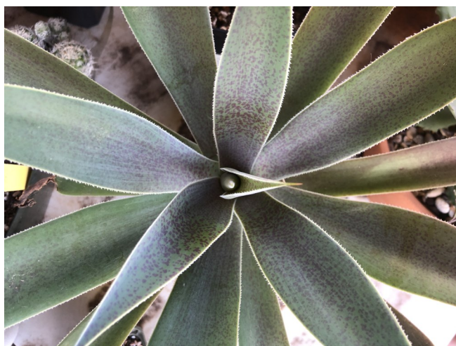
Mangave "Lavender Lady"