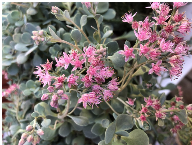
Sedum "Sunsparkler Elf"